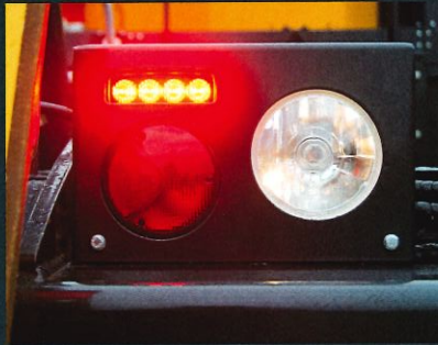
Rear flashing lights supplement the audible warning signals for the safety of those inside and outside the cab.