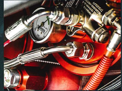
Extinguishing system and diesel particulate filter in accordance with tunnel construction requirements.