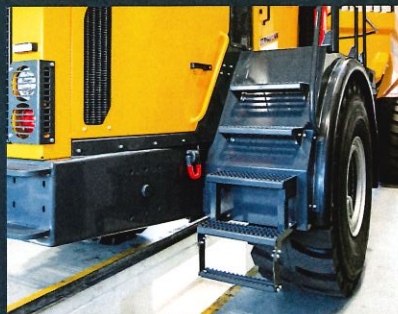
Safe ascent and descent outside of the danger zones and within the driver's field of vision.