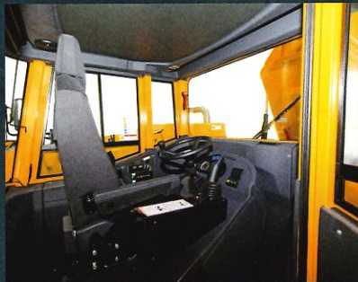
Swivel seat for the best overview and transport performance.

Tunnels are demanding. As well as needing high transport performance in confined spaces, they also require the highest in operational safety and the best in occupational health and safety.