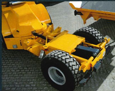
Carrier vehicles are prepared ex works depending on our customers' individual transport needs.